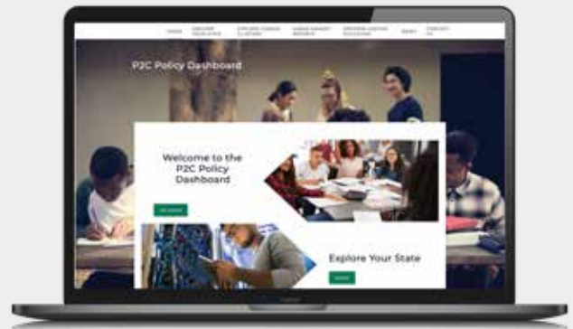
Simple labor market exploration resources for educators